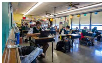
Saint Michael the Archangel, Levittown, Pa.