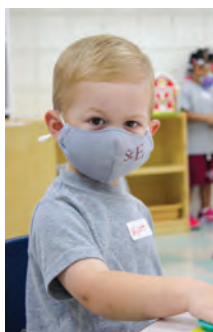
Saint Elizabeth School, Wilmington, Del.